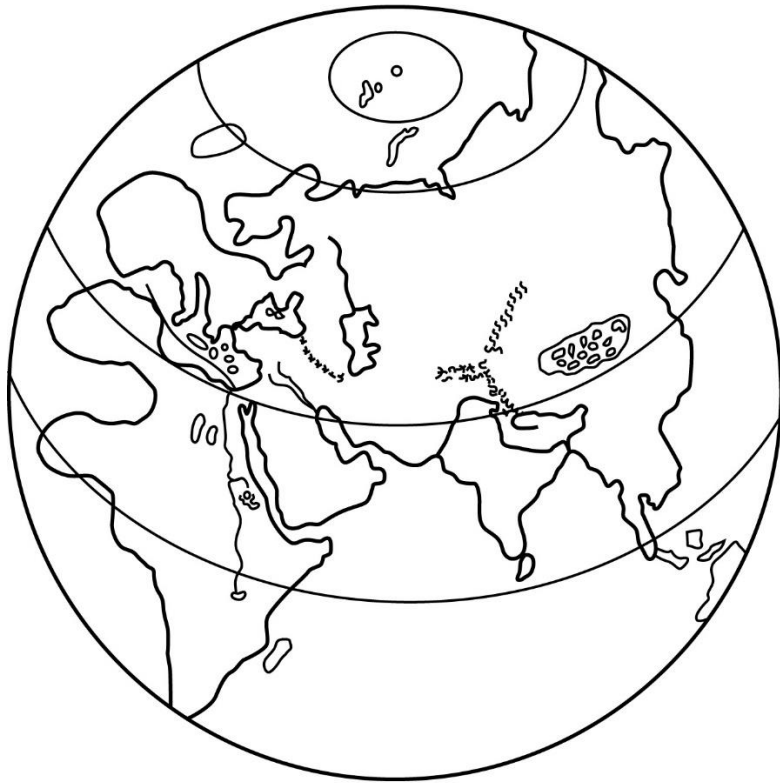
The circum-Indian Ocean eastern hemisphere in 1951 A.D.