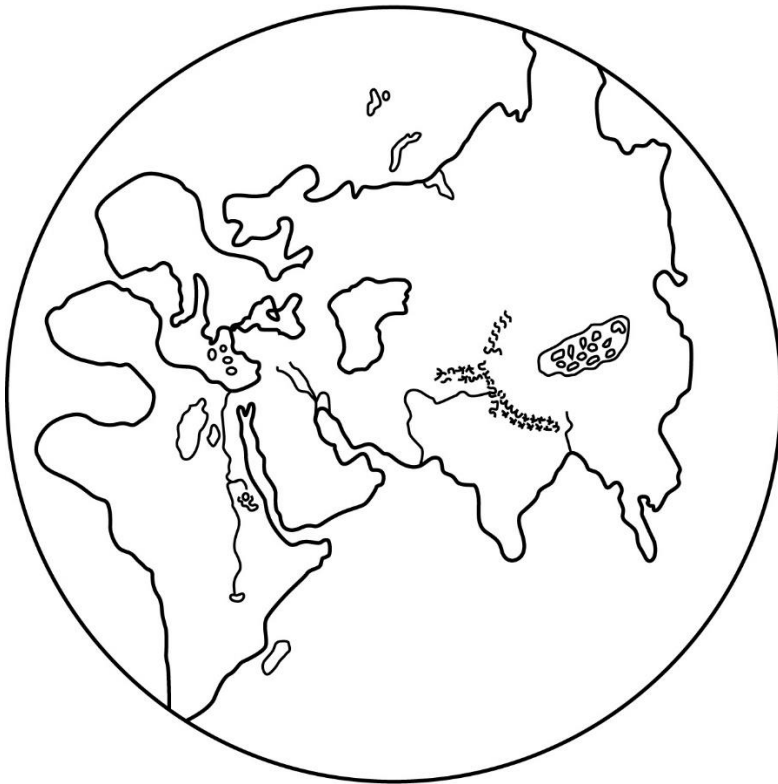
The circum-Indian Ocean eastern hemispherical lands during the Late Pliocene period, approximately 1,000,000 B.C.