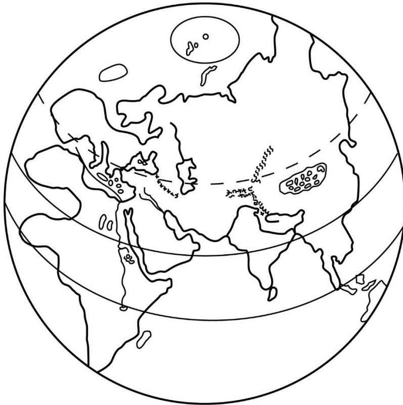
The land of a north sub-tropical eastern hemispherical circum-Indian Ocean civilization, approximately 10,000 to 12,000 B.C.