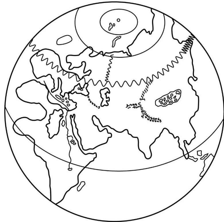
Suggestion of eastern hemisphere at end of last great glaciation, the late Pliocene period, approximately 500,000 B.C.