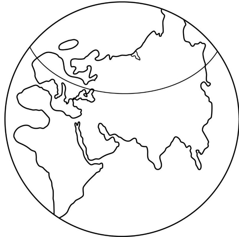
The circum-Indian Ocean eastern hemispherical region at the end of the last period of widespread glaciation approximately 5,000 B.C.