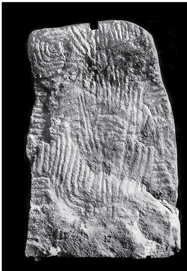
DOLMEN DE GAVR' INIS