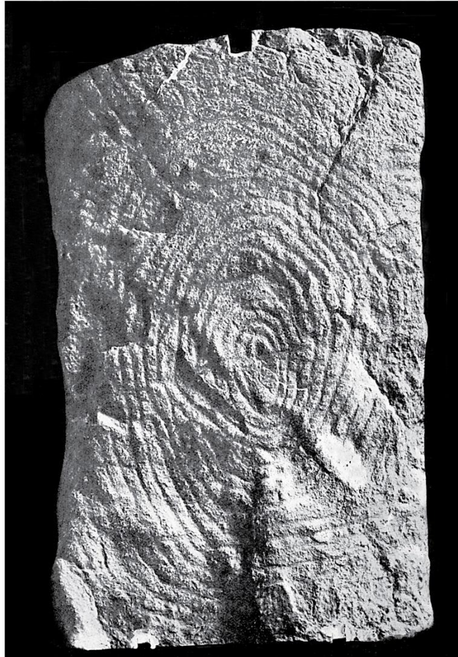
DOLMEN DE GAVR' INIS No 6

Here a diagram of the library, some photographs of a few of its books, other photographs made of casts of other ones of the books, and some line reproductions of some of the motifs of composition.