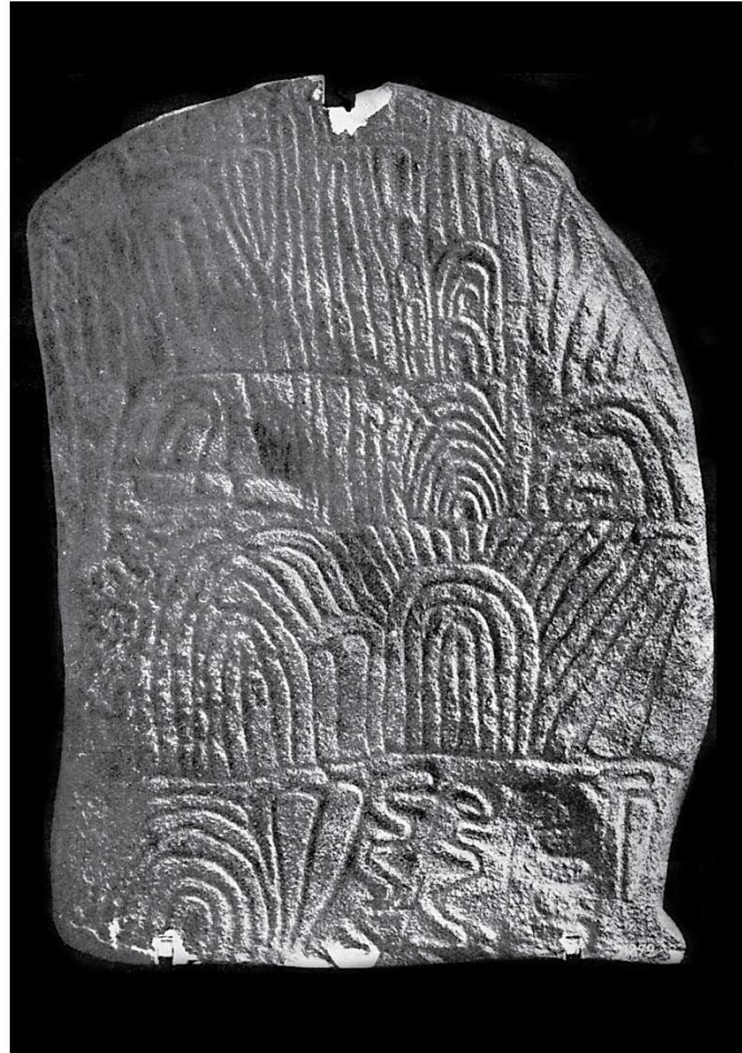
DOLMEN DE GAVR' INIS No 8

Here a diagram of the library, some photographs of a few of its books, other photographs made of casts of other ones of the books, and some line reproductions of some of the motifs of composition.