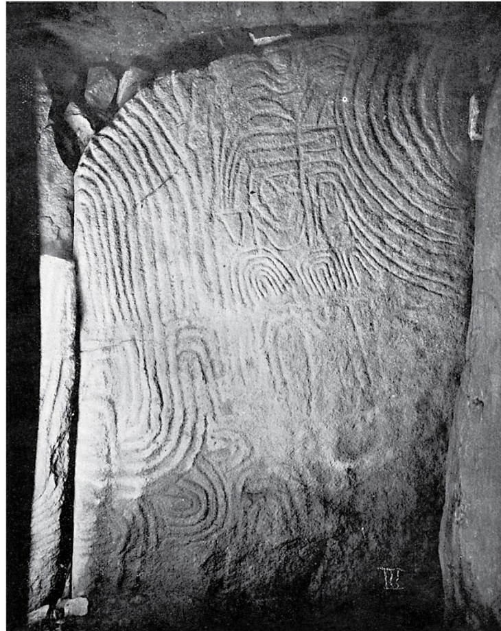
DOLMEN DE GAVR' INIS No 15

Here a diagram of the library, some photographs of a few of its books, other photographs made of casts of other ones of the books, and some line reproductions of some of the motifs of composition.