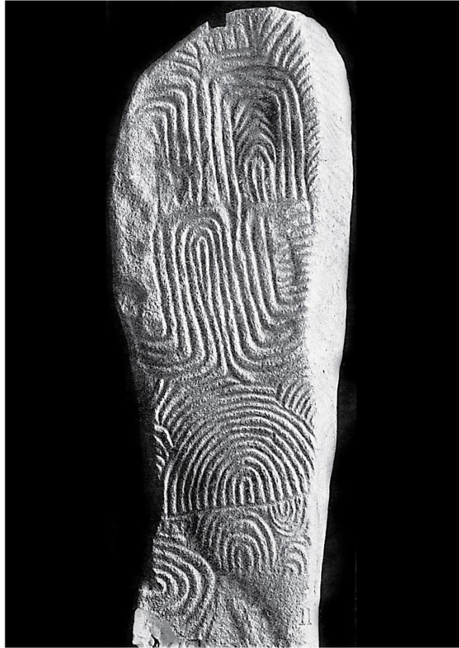
DOLMEN DE GAVR' INIS