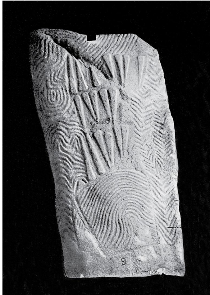
DOLMEN DE GAVR' INIS