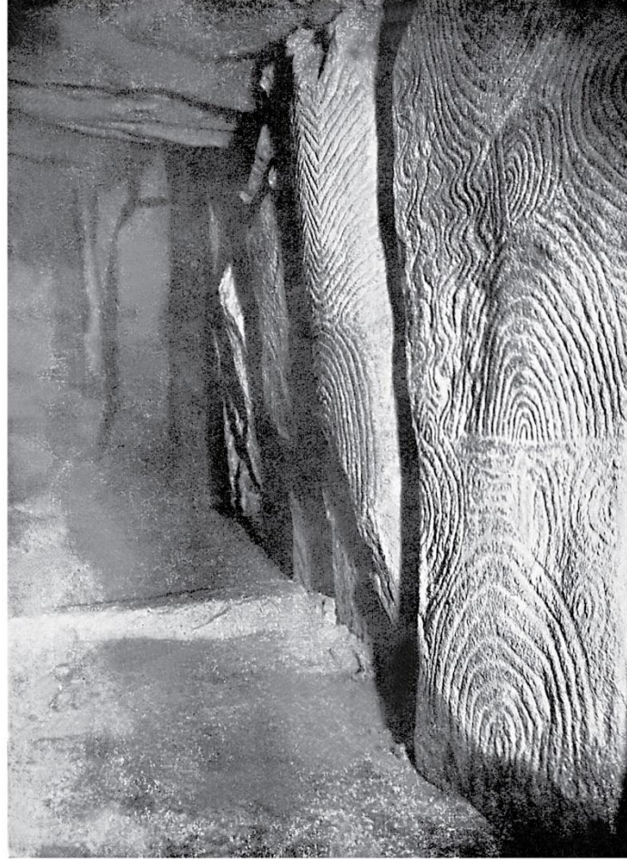
DOLMEN DE GAVR' INIS No 4 ET 5

Here a diagram of the library, some photographs of a few of its books, other photographs made of casts of other ones of the books, and some line reproductions of some of the motifs of composition.