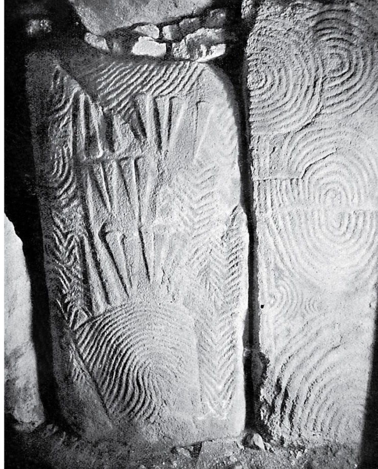
DOLMEN DE GAVR' INIS