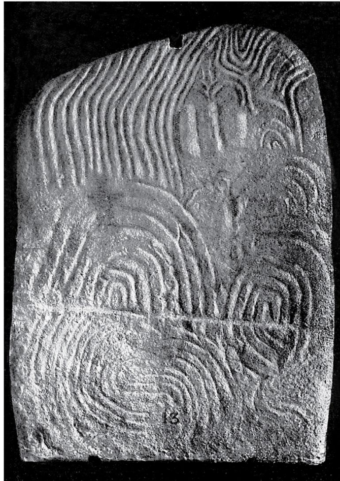
DOLMEN DE GAVR' INIS