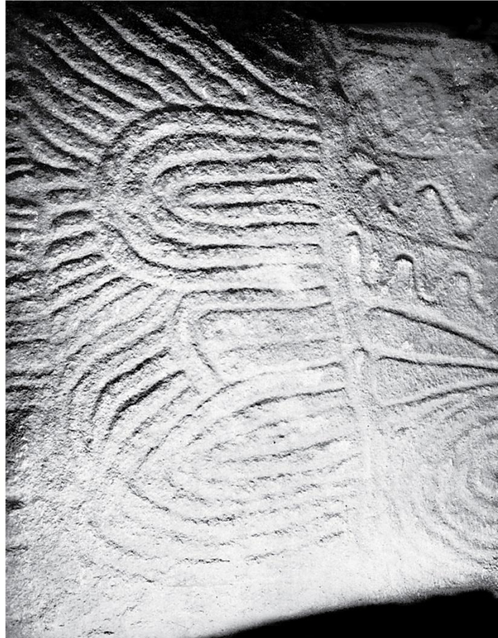
DOLMEN DE GAVR' INIS