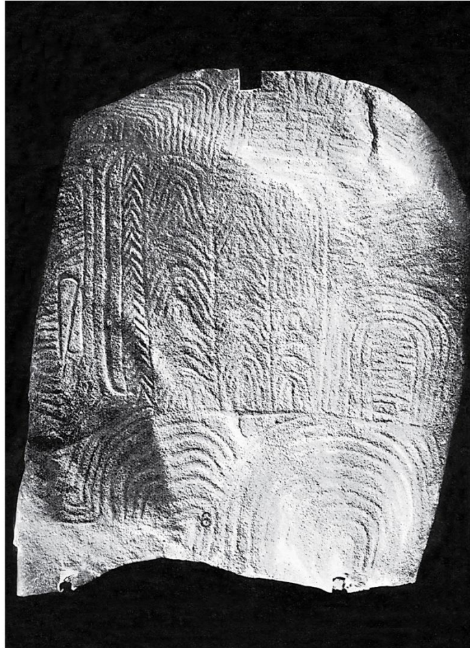
DOLMEN DE GAVR' INIS No 24

Here a diagram of the library, some photographs of a few of its books, other photographs made of casts of other ones of the books, and some line reproductions of some of the motifs of composition.