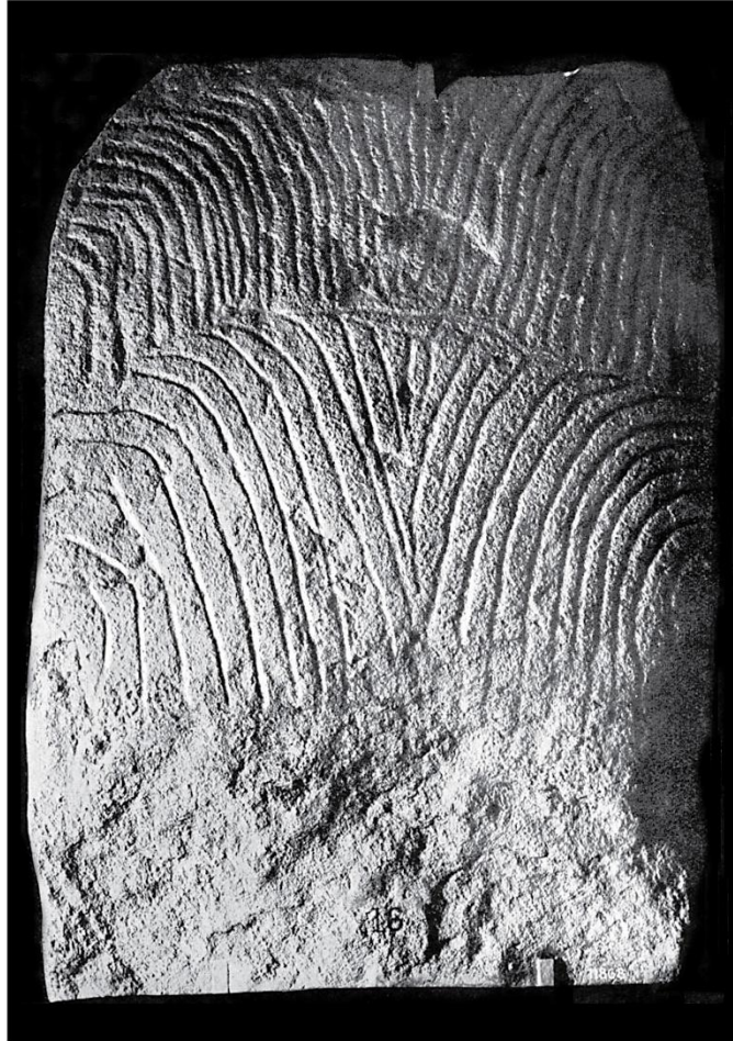
DOLMEN DE GAVR' INIS