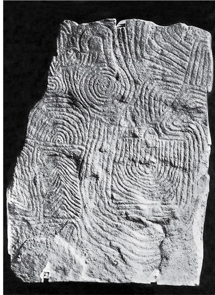
DOLMEN DE GAVR' INIS No 25

Here a diagram of the library, some photographs of a few of its books, other photographs made of casts of other ones of the books, and some line reproductions of some of the motifs of composition.