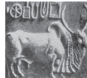
Indus Valley Signs as shown in David Diringer's The Alphabet , (New York Philosophical Library, 1948).