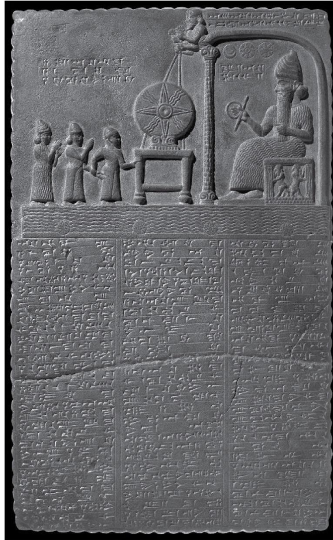
Neo-Babylonian cuneiform tablet. 860 BC-850 BC, as shown in David Diringer's The Alphabet , (New York Philosophical Library, 1948) p. 52, Figure 23.